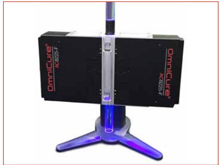
FIGURE 3: A set of OmniCure AC8225-F UV LED curing systems with lenses facing each other.

For a “wet-on-wet process”, optical shadowing of the primary coating by the secondary coating may lead to slower draw speed or the requirement for an increased number of UV LED systems. Further testing with different and improved formulations of primary coatings may be able to eliminate the problem of shadowing and allow faster throughput.