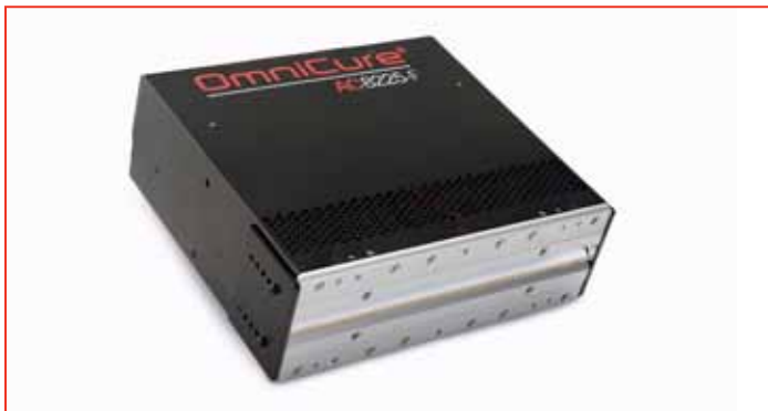
FIGURE 2: OmniCure AC8 Series with custom focusing lens.

UV LED systems, such as the OmniCure AC8225-F, (see figure 2) can provide an alternative or a complement to current UV arc lamp-based curing systems in fiber optic manufacturing processes. These systems can be used in a number of configurations depending on the manufacturing process and coating material. One cost-effective configuration involves replacing each UV lamp-based system and reflector mirror with one or more sets of OmniCure AC8225-F systems, with focusing lenses facing each other to achieve a uniform UV intensity at the fiber (see Figure 3).